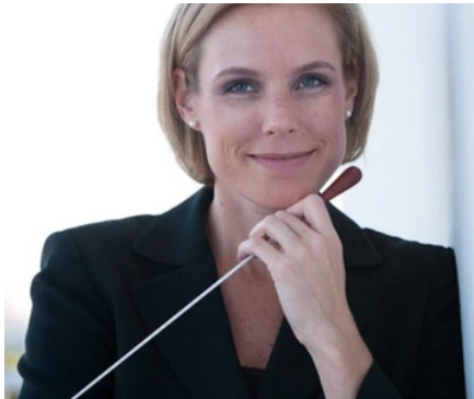
IMAGE GALLERY: High-resolution press images are available in WMPA's Media Image Gallery .